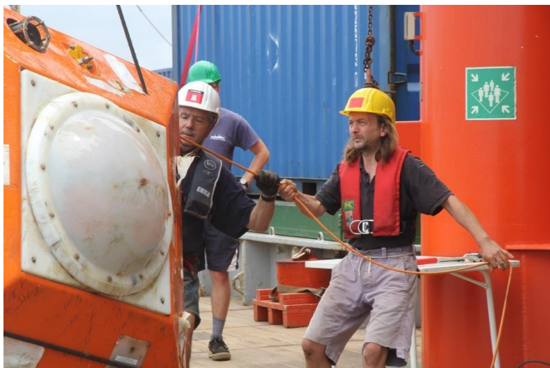
Fig. 1: Recovery of a bottom shield deployed at 500m depth along 11°S.

During METEOR cruise M98 in July 2013, nearly 2 ½ years ago, two moorings and two bottom shields were deployed at the 11°S transect. Due to several different circumstances, the moored equipment could not be serviced as scheduled last year. We are thus relieved to have recovered most of our instruments after the unexpectedly long deployment period. The two most important components of the array, a bottom shield deployed at 500m (Fig. 1) and a mooring deployed at 1200m